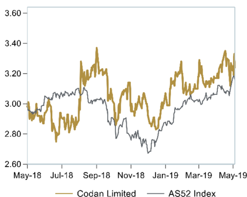
Codan Limited vs. AS52 (rebased index)