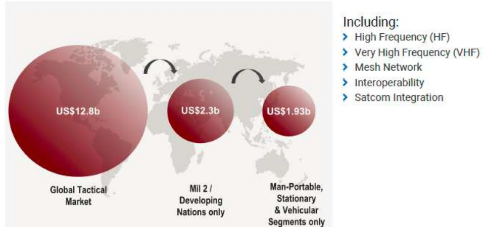
Figure 2: $1.9b HF addressable market