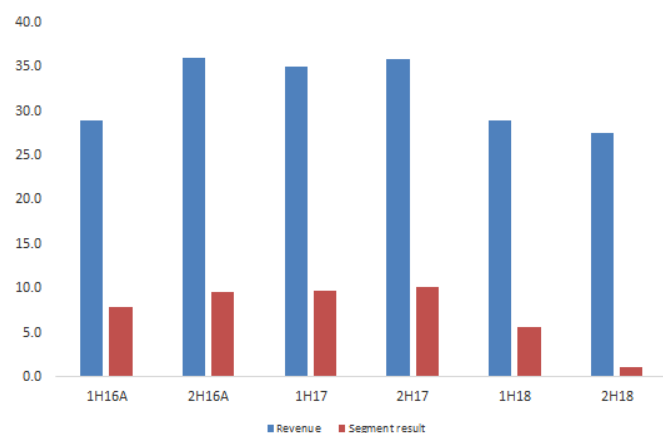
Figure 4: Radio Communications underperformed during the period however management expect base level revenue to be achieved in FY19 due to a healthy order book