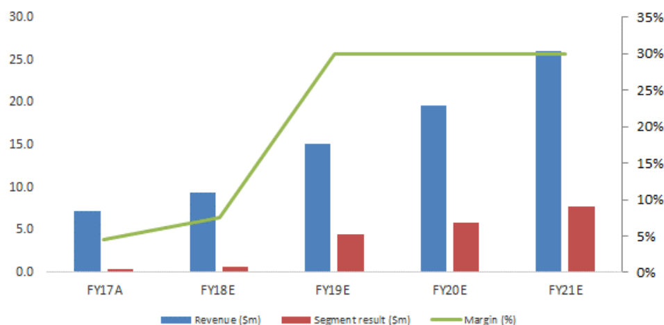
Figure 6: We expect Tracking Solutions to generate profitability on the back of the agreement with Caterpillar in FY19