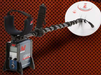
GPX 4500 (2008)